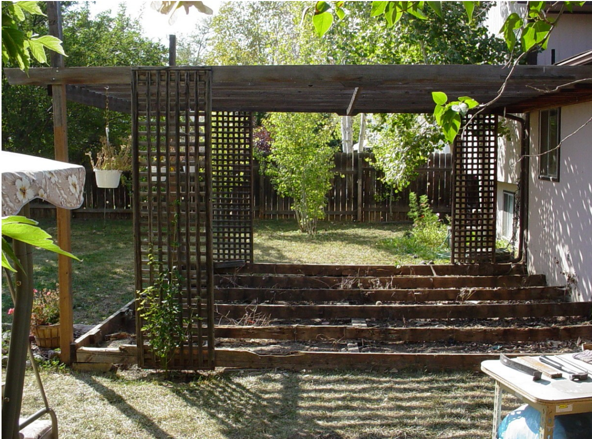
Layout for new deck using Trex decking