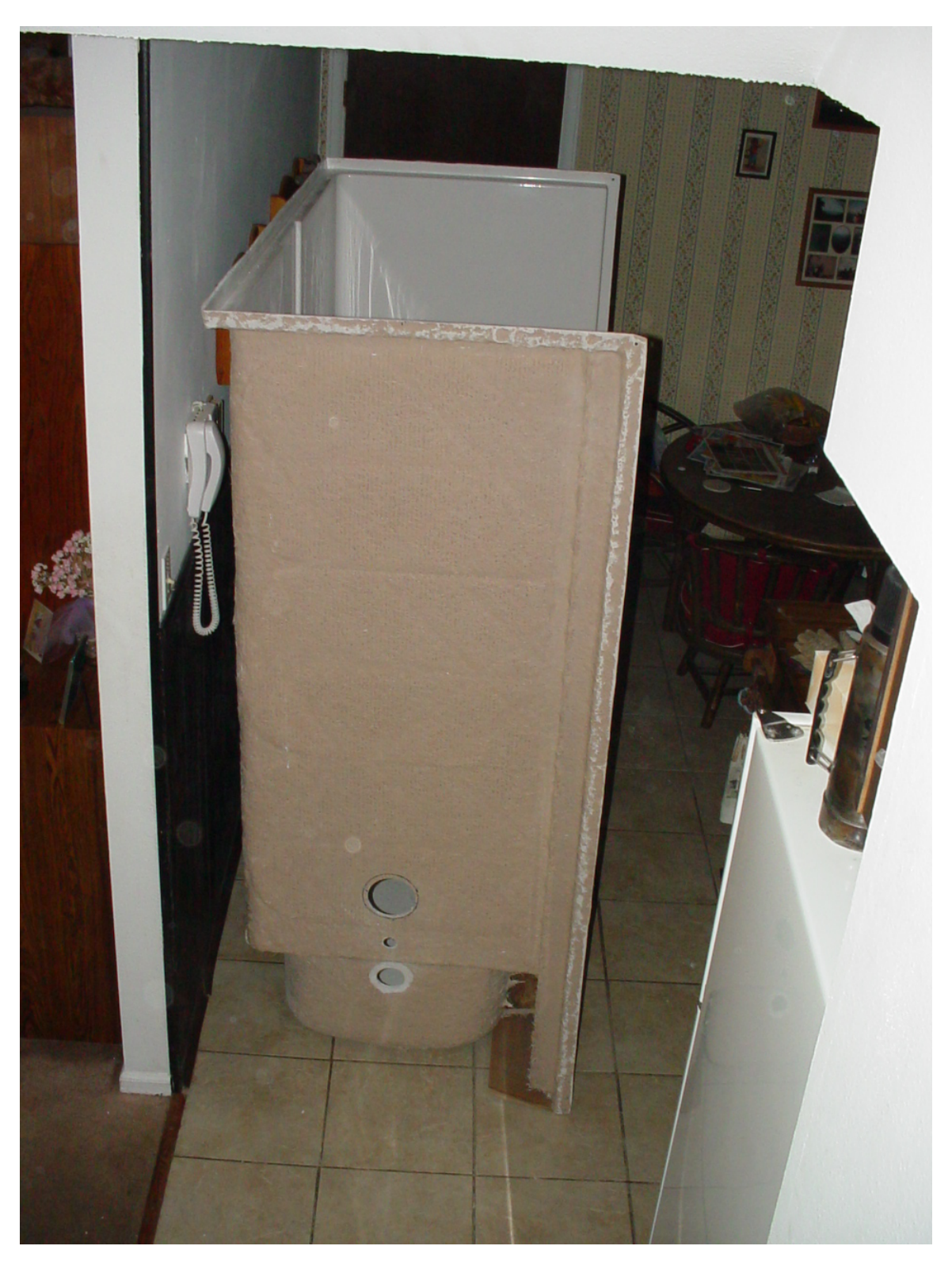
Next the walls and the trim

I went with the one piece unit that had to go in through the wall In the upstairs closet.