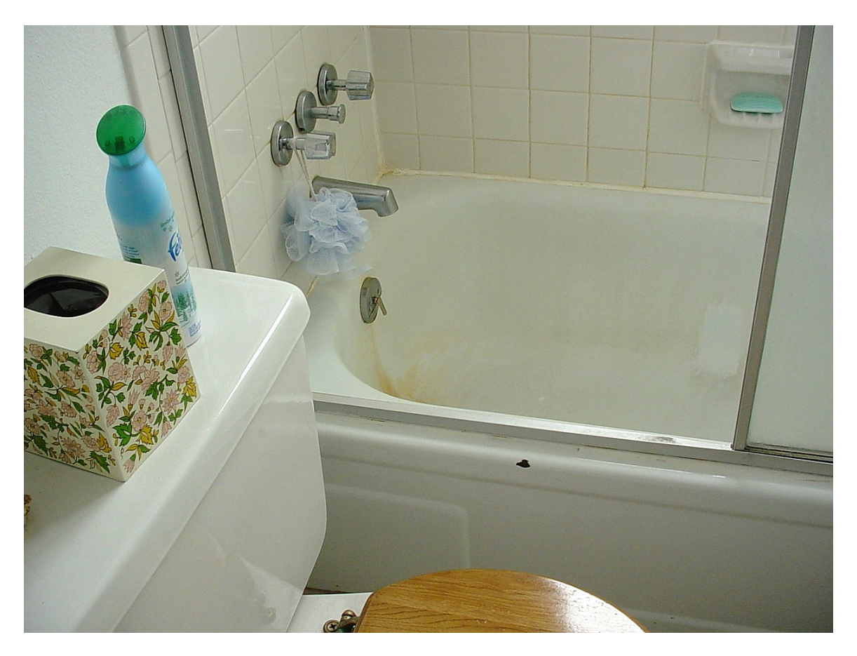
Had to tear out the cracked tile and dripping plumbing