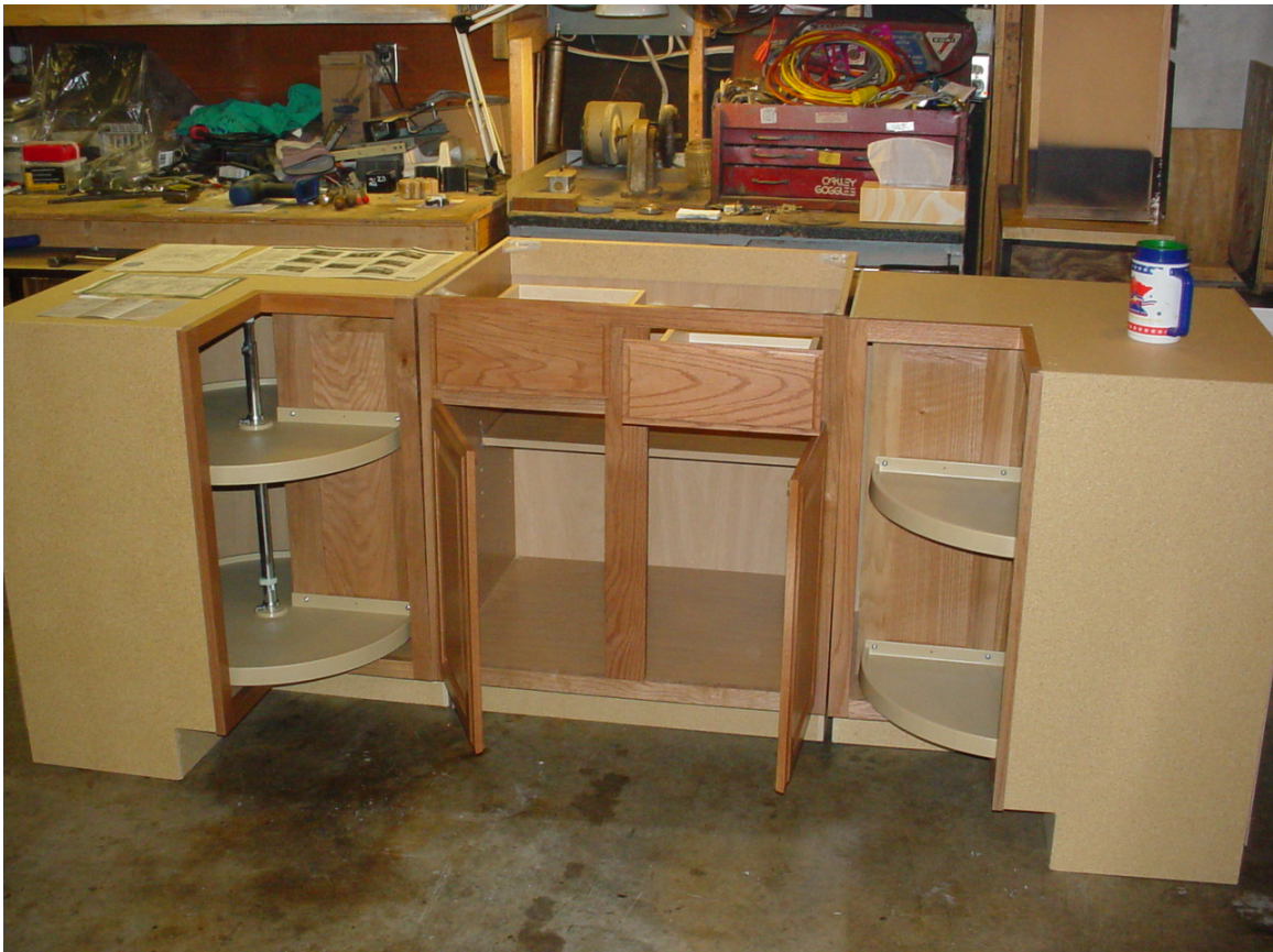
I modified a standard base cabinet for a sink base