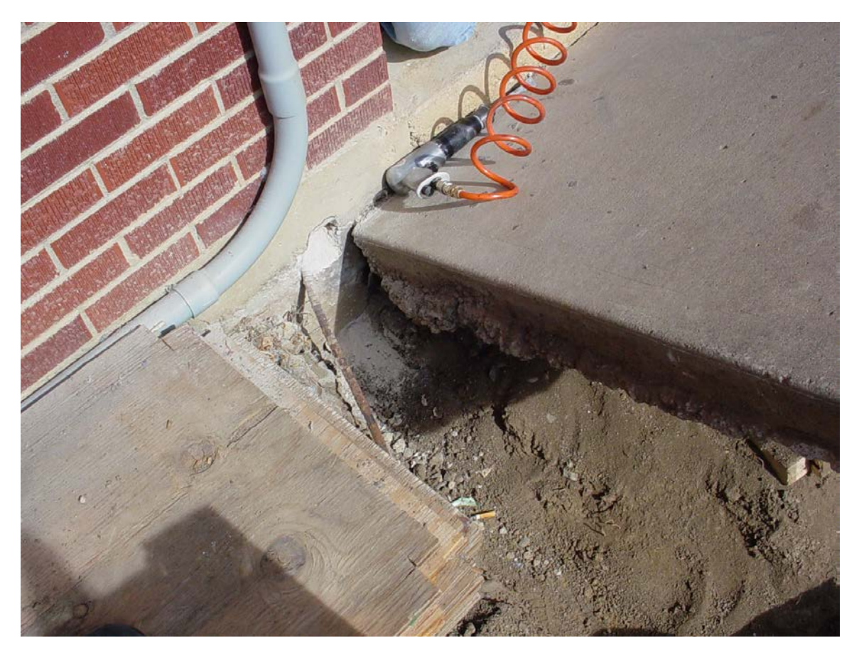
The 2 \frac{1}{2} seal tight has 6 12-AWG for the 120 Volt supply