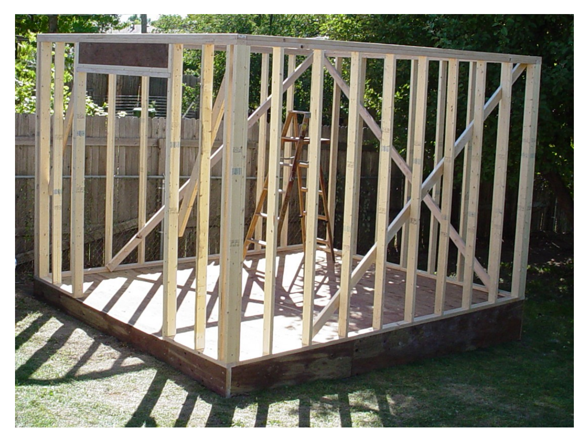
This is the 12 X 14 Shed to be my wood working shop