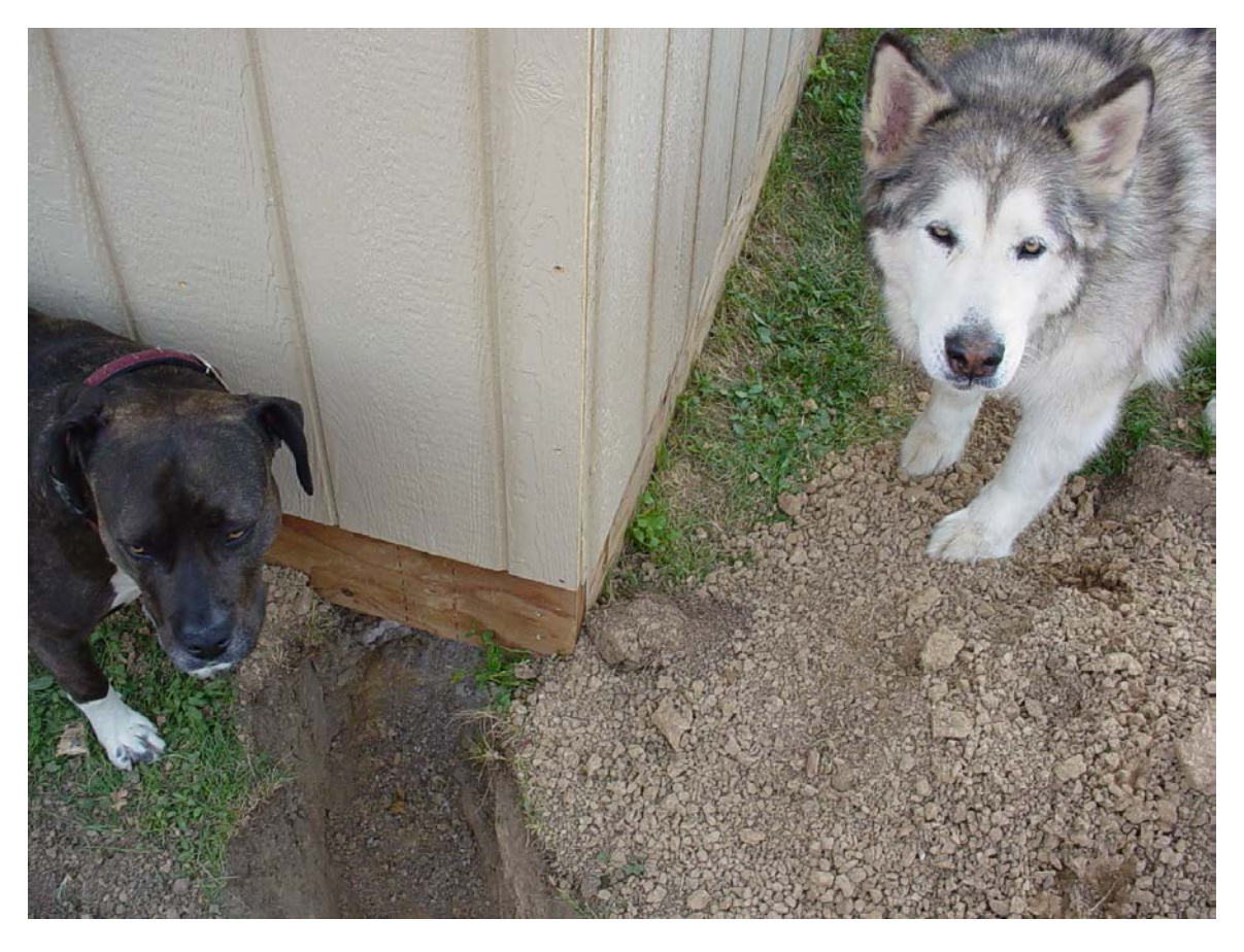
The dogs thought I was digging for chipmunks